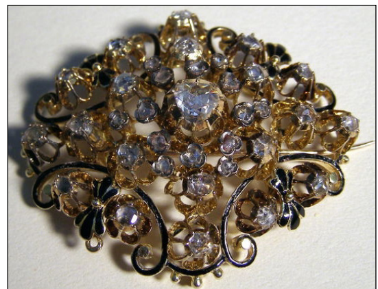
Fetching $1,208 was this 18K gold brooch with 37 diamonds.