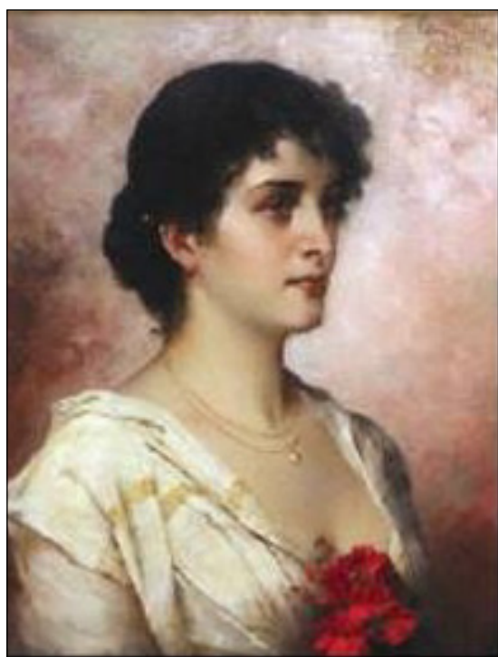
Top lot of the sale was a striking portrait of a woman done by German American artist Conrad Kiesel. It sold to a buyer on the phone for $7,475.