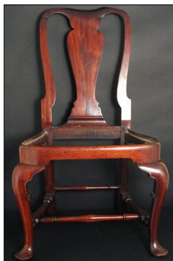
A Queen Anne chair from an East Greenwich, R.I., home sold for $2,990.