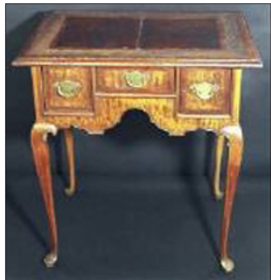
There were several phones and some floor action for this Eighteenth Century New England lowboy. After a quick round of competitive bidding, the lowboy went to the phone for $2,300.